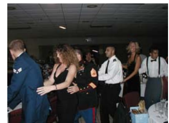
All aboard... Choo...Choo!