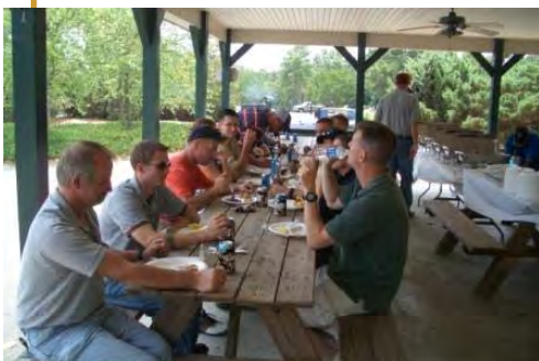
HOT CHOW, get it while it's hot!!!!!! BBQ is a great ending to a long day.