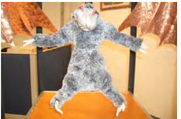
The ugliest mascot ever, we selected this because of the name of our communications vehicle; the BADGER