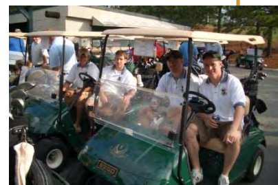
B-Troop Golf Team in their matching Polo shirts were sure to be a force to be reckoned with. They were all awarded a JCU coffee mug for placing as the last place team, but they had a great time.