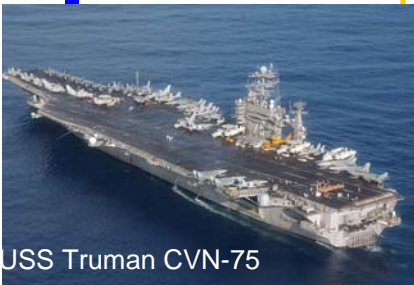
USS Truman CVN-75