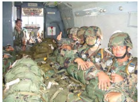
This picture gives new meaning to "Packed like sardines"; Airborne OP with combat equipment