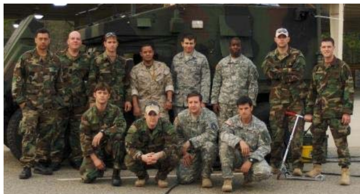
Members of A, B & D-Troop at a recent exercise. Team continuity and cohesion is the cornerstone of our communicators