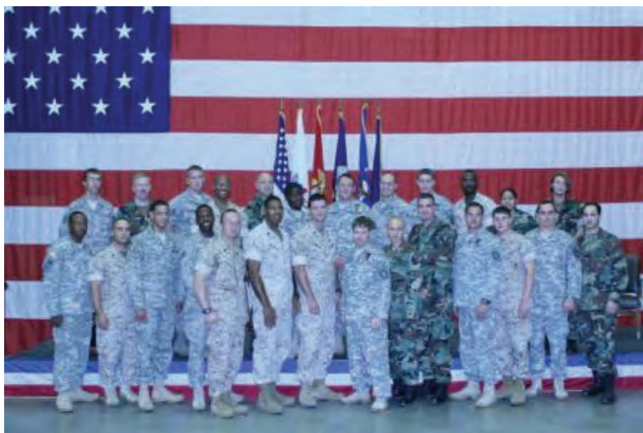
SOROC Class 01-08 taken on graduation day July 2, 2008

This section features a current Unit member. It is a look back before all of those military regulations, haircuts and discipline. Stay tuned for the answer posted in next months edition.