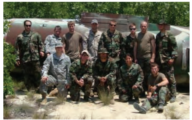
Right; Memebrs of B-Troop during a recent exercise