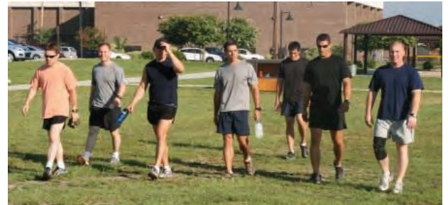
Above; C-Troop looking strong moving from the litter carry to the shuttle run