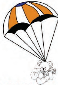
LOOK WHO JUST DROPPED IN