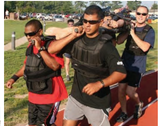
Above; The E-Troop team starts their quarter mile run with Scuba Steve on a litter