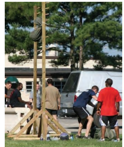
Delivering the Message