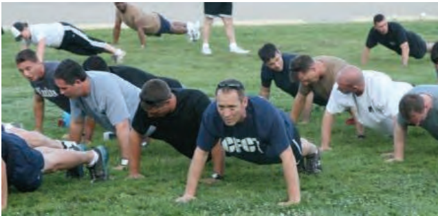
Left; Everyone started the day off with a round of Push-ups