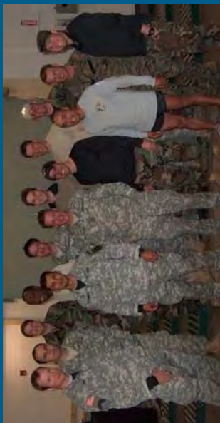
C-Troop after a Airborne Operation with follow-on training