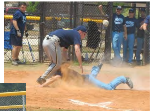
Above: It's all about sacrifice