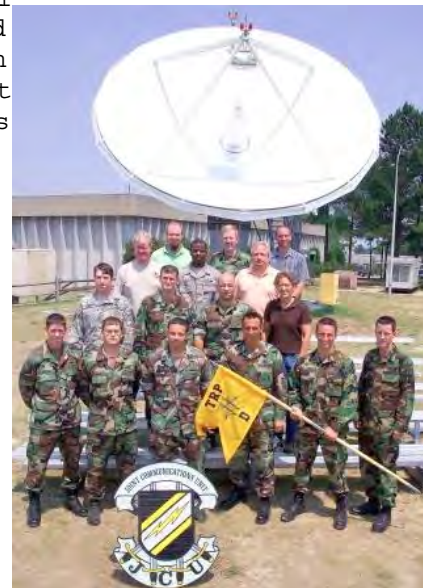
Below : D-Troop photo on 10 JUN 08