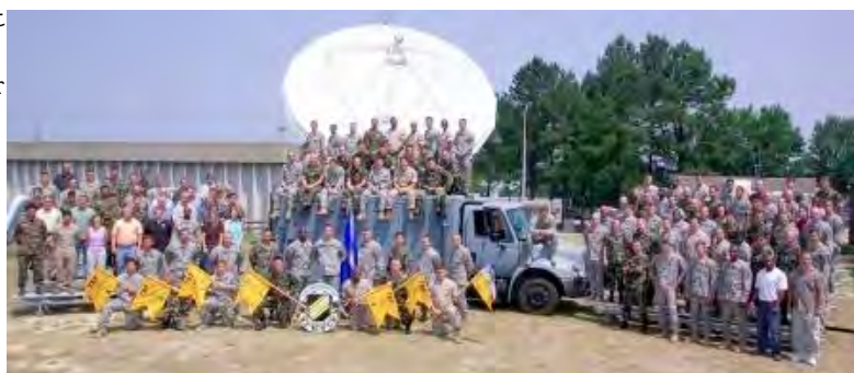
Below : All of the JCU members that were here got together for a unit photo on 10 JUN 08. It was the first picture in over five years. It had to be the hottest day ever on Fort Bragg. You can't see it because the picture is small, but everyone's eyes were closed because of the sun.