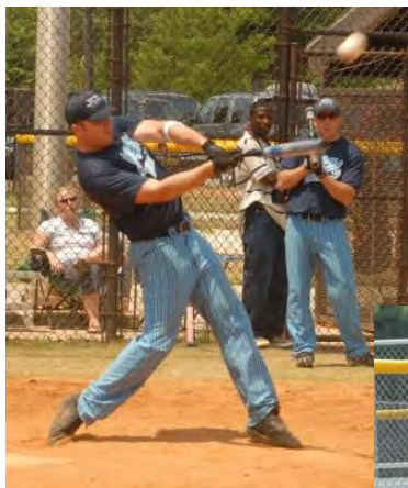
Left: See ya!