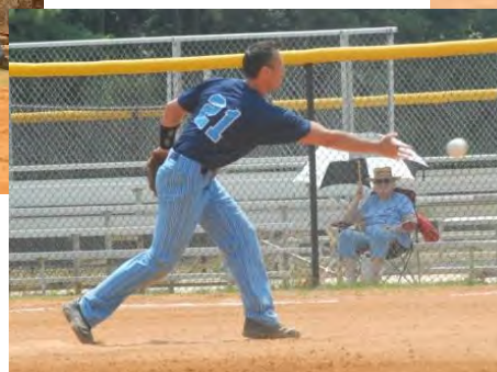
Below: The Petzel pitch