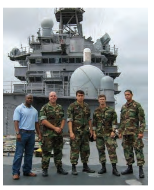
Above; Members of A & B Troop during a recent training exercise.