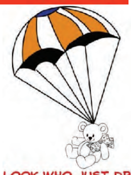
LOOK WHO JUST DROPPED IN