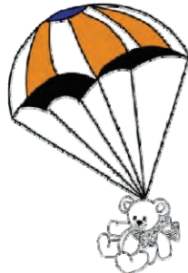
LOOK WHO JUST DROPPED IN