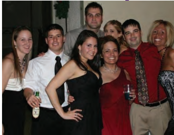
Right: Group shot