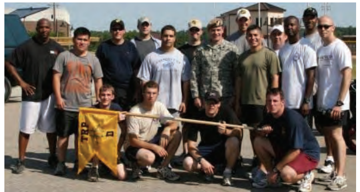
Above: Members of D-Troop took a moment for a photo-op with the Commander after the Highland Games 1 JUL 09