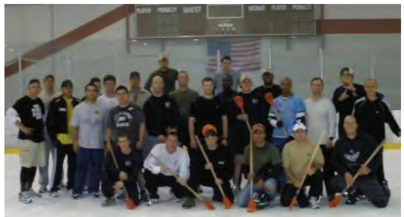
Above: Members of C & D-Troops got together for a little "friendly" game of Broomball at the ice rink. There were only minor injuries reported