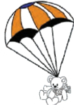
LOOK WHO JUST DROPPED IN