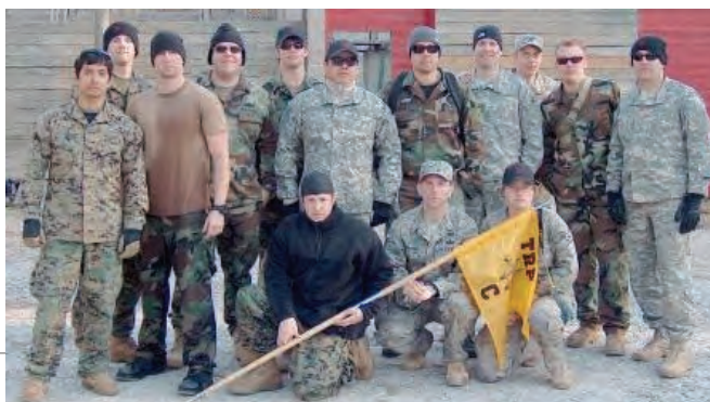
Left: Members of C-Troop at a recent training exercise