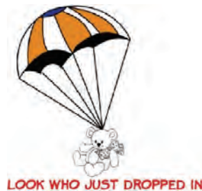
LOOK WHO JUST DROPPED IN