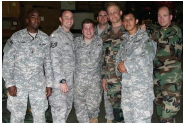
Above: Members of A-Troop pause for a photo before the jump