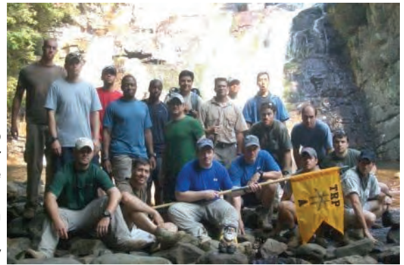
Above: Members of A-Troop spent some good, quality time on the Appalachian Trail in August