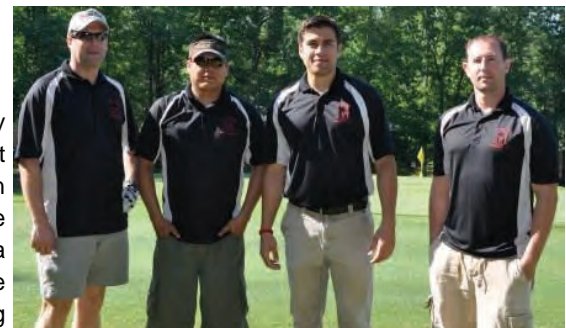
Above: Members of C-Troop take a moment for a picture during the annual golf tournament on 21 MAY 10