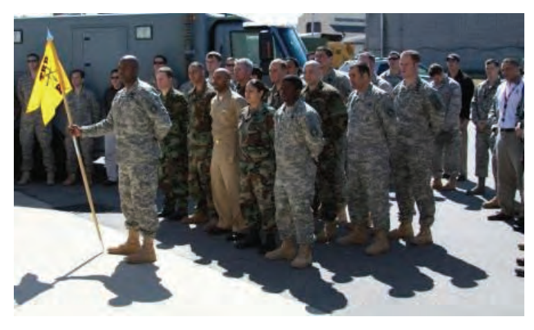
Above: Members of B-Troop in formation during the Change of Responsibility ceremony on 5 MAR 10