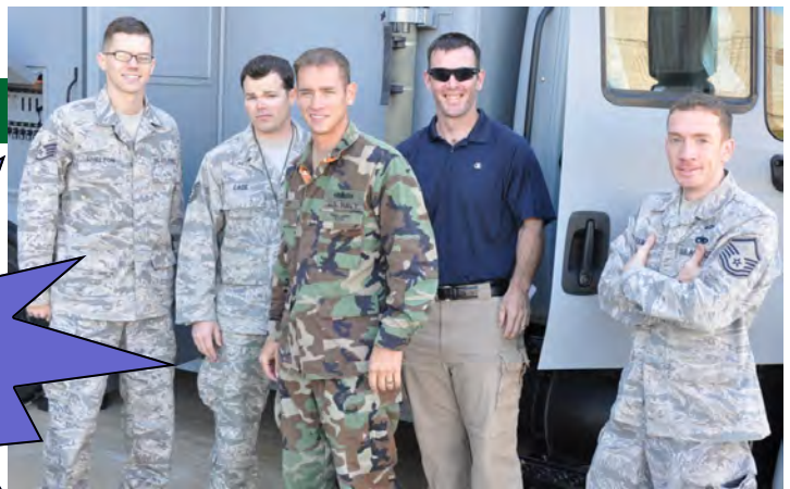
Above: Members of A & M-Troops pause their busy schedule to get a photo taken. You just never know where the 1SG may pop up from to snap a historical photo

30th ANNIVERSARY DECEMBER 16-17, 2010 RSVP WITH 1SG SPENCER BY DECEMBER 1, 2010