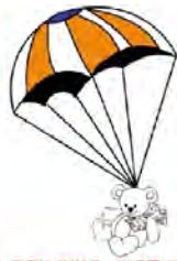
LOOK WHO JUST DROPPED IN