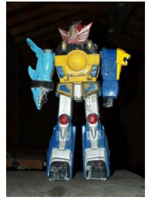
Take me with you!!