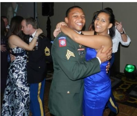
Who doesn't love the Robot?