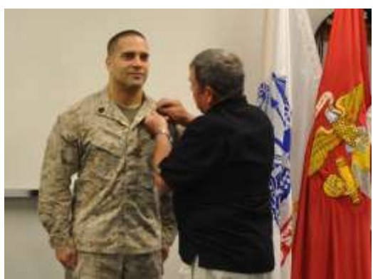
Super Hud getting pinned to GySgt