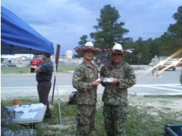
A Troop is reduced to selling burritos out of the back of a mule....Times are tough! (BTW, muy bien!)