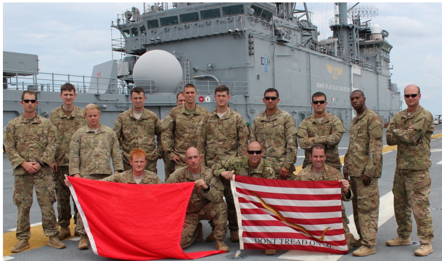
A troop getting their sea legs