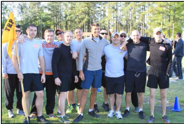
B Troop—Winners of the Spring 2016 Highland Games

Troops battled it out in the 10th annual highland games competition. In true JCU fashion, each Troop brought their best efforts to events like the caber toss, stone throw, and litter carry. The day was capped off with a burger burn and the awarding of the prized highland games streamer. Thanks to everyone that made this day a success.