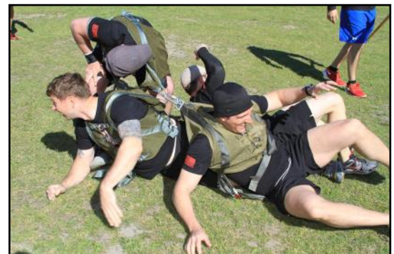
A Troop trying to perfect the "spider harness shuffle"