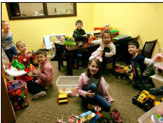
The toughest critics of the night take a quick play break