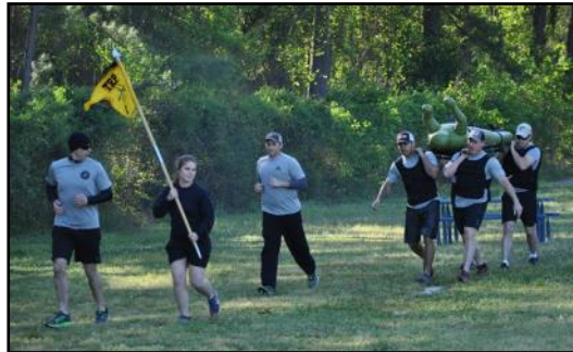
M Troop rocking the litter carry