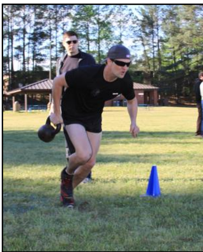
Rules of SMT