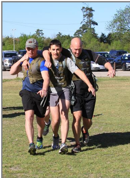
Perfect form during the Spider harness relay

I would like to highlight a few accomplishments over the