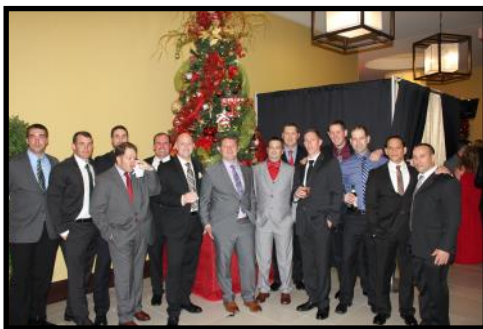
C Troop Alumni pose for a picture

JCU celebrated its 35th Anniversary bringing together unit members, alumni, friends, and family. Spanning several days, events included a tour of unit areas, a golf tournament, socials, and the anniversary ball. It was a time to celebrate where JCU has been and where it is going. It was a great time for both old and new to reflect upon the impact this unit has had on our nation. Thank you to everyone that made event a success. -1SG