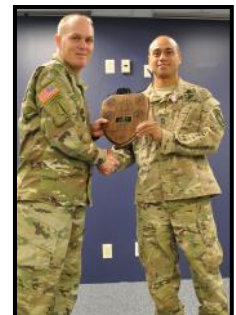
OT Receives the coveted JCU plaque from CSM Flaker