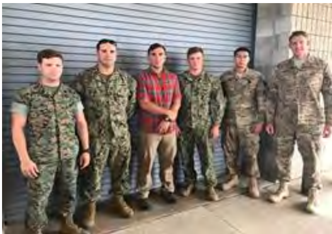
BELOW: D Troop's newest SOROC grads on day 1 in the troop: One of these things is not like the other...