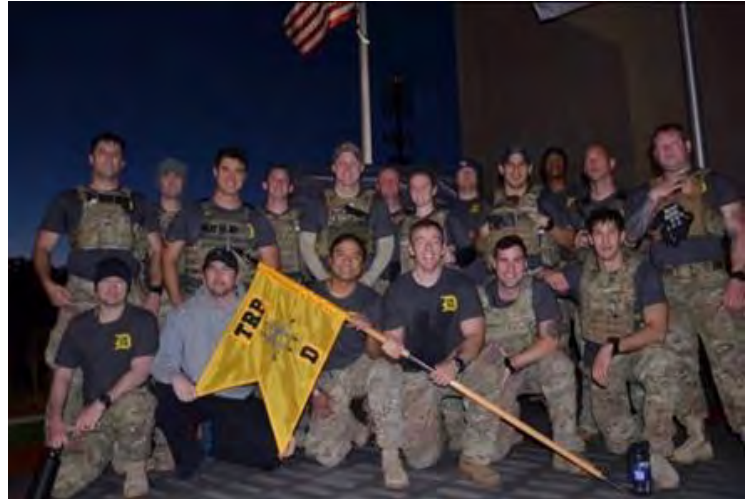
The Troop after a "Command Sergeant Major" sponsored PT event. It was a sweaty morning...

As I'm sure you are aware, the command is focusing more attention to