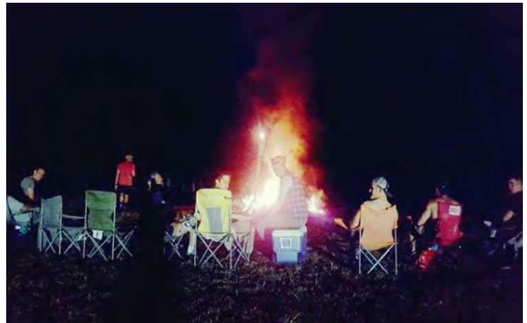
Several A Troopers enjoying a fire during Viking Night.